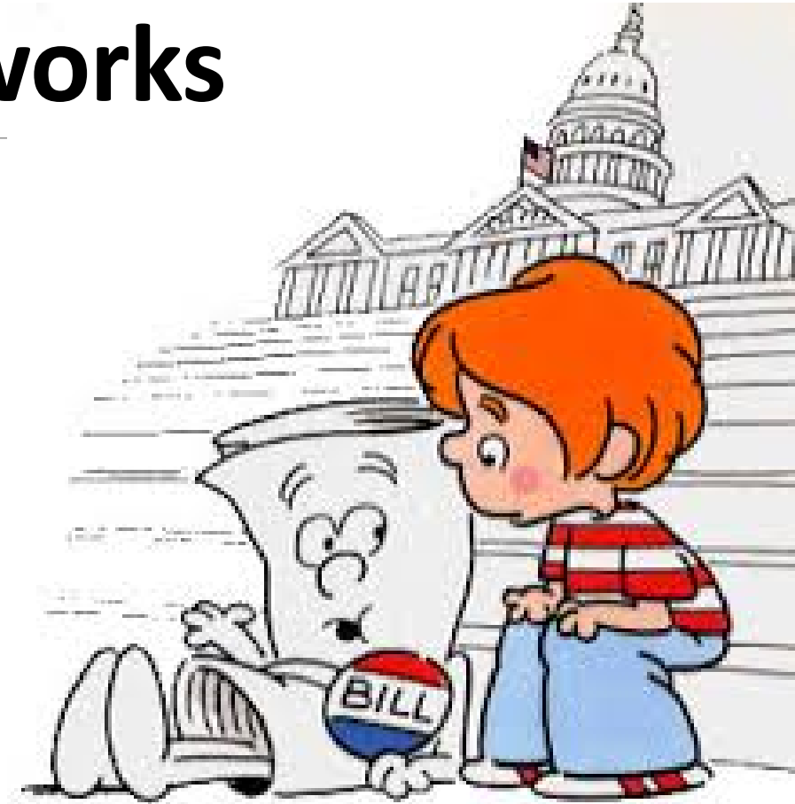
Schoolhouse Rock: America - I'm just a bill [YouTube video]

Executives like the student body president hold a lot of ceremonial external power. But, internal power is often held by student chiefs of staff or adult advisors.